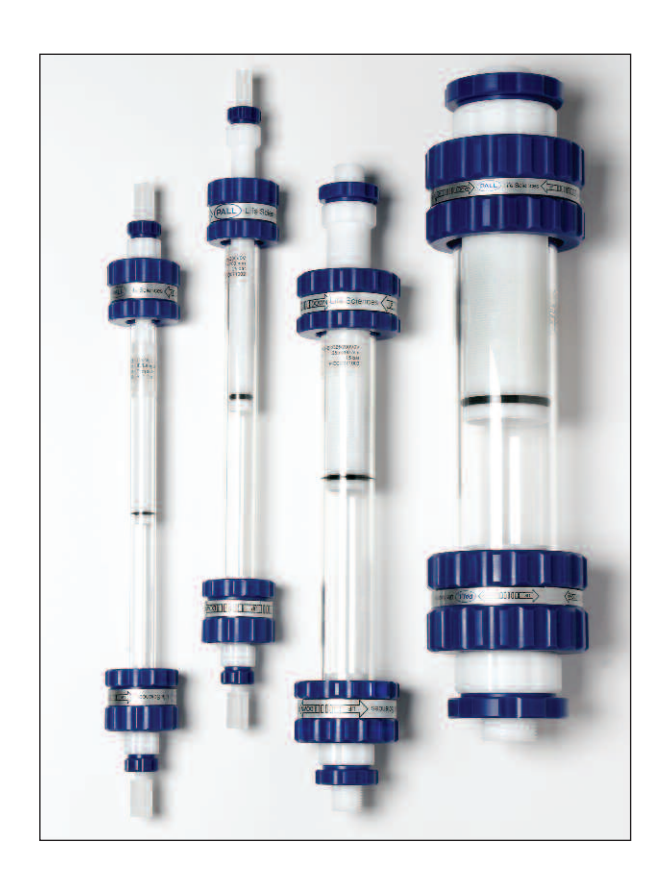
Table 1 LRC Column Specifications

Each column is supplied assembled and ready for use, with tubing and fittings to connect the column to a chromatography system.